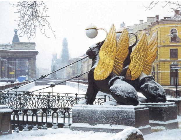
The Bank Bridge in Winter

S t. Petersburg is nice and charming not only in summer, but also in winter. Winter landscapes in combination with magnificent architecture makes the city really great. The nature of the area in winter helps one feel and understand the severe beauty of the North capital of Russia.