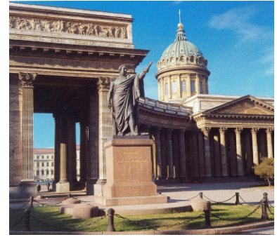
The Kazan Cathedral

Learn Russian at ProBa - near Nevsky Prospect - it's meant to be in the focus of cultural life, business activities and public amusements of St. Petersburg.