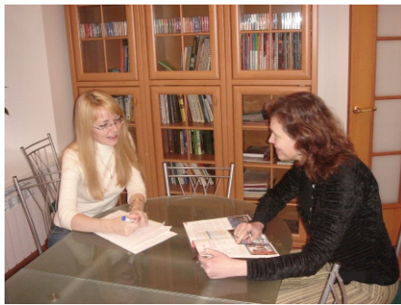
Our library, Individual Course

Studying in Russia is a life-altering experience. Living in a different culture will help you see the world from a completely different perspective. It is an amazing experience that will change your life.