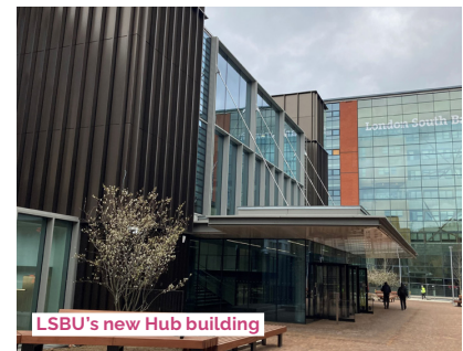
LSBU's new Hub building

The Kings management team will confirm arrangements on-site.