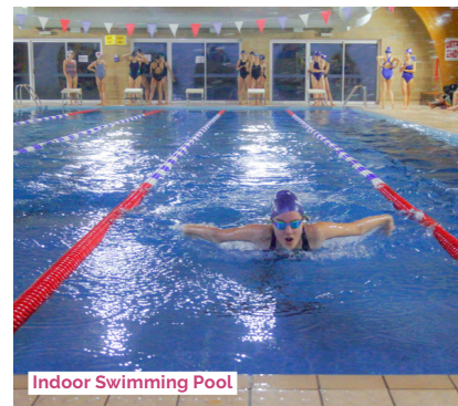
Indoor Swimming Pool