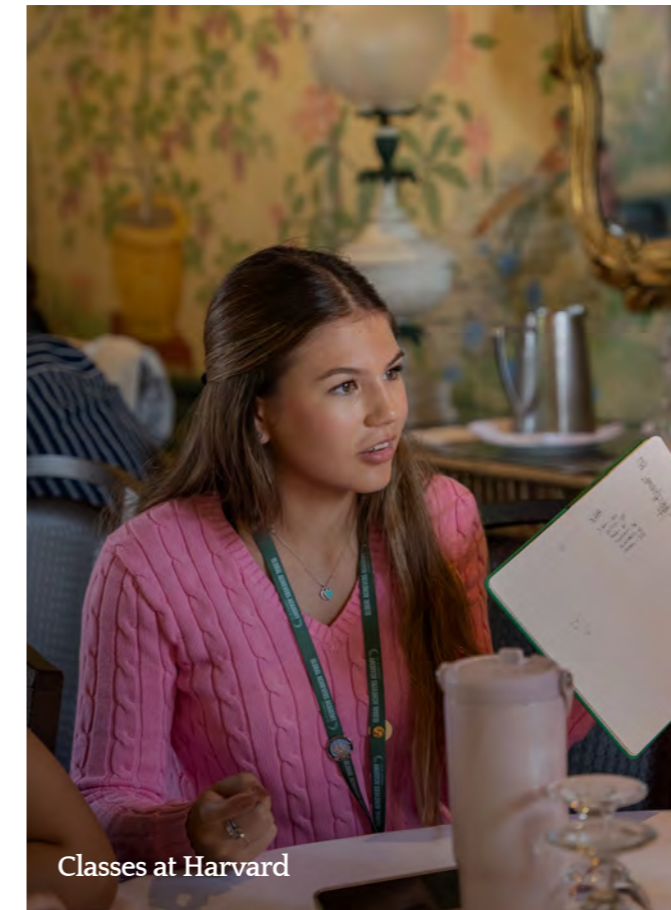
Classes at Harvard

In addition to parts of the academic programme taking place on campus at Harvard University, our students also have the opportunity to stay in university halls of residence at the nearby Tufts University,