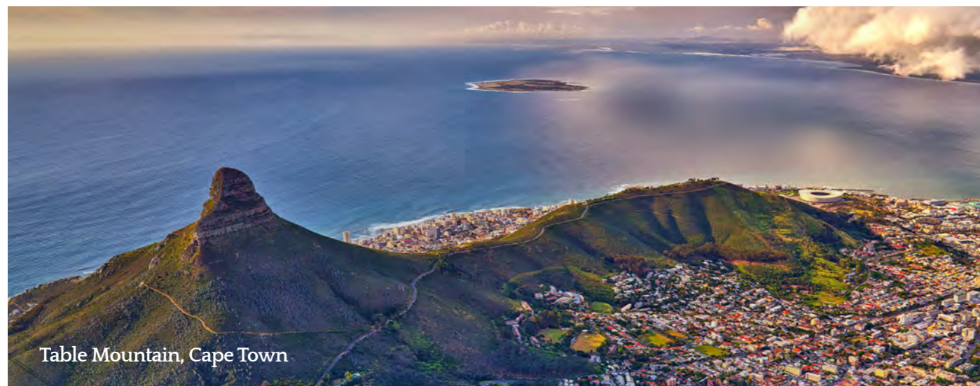
Table Mountain, Cape Town

Coming soon, our global achievers will spend an incredible two weeks in this amazing part of the world truly immersing themselves in the incredible culture, its people, its environment, its food and experience spectacular scenery and wildlife!