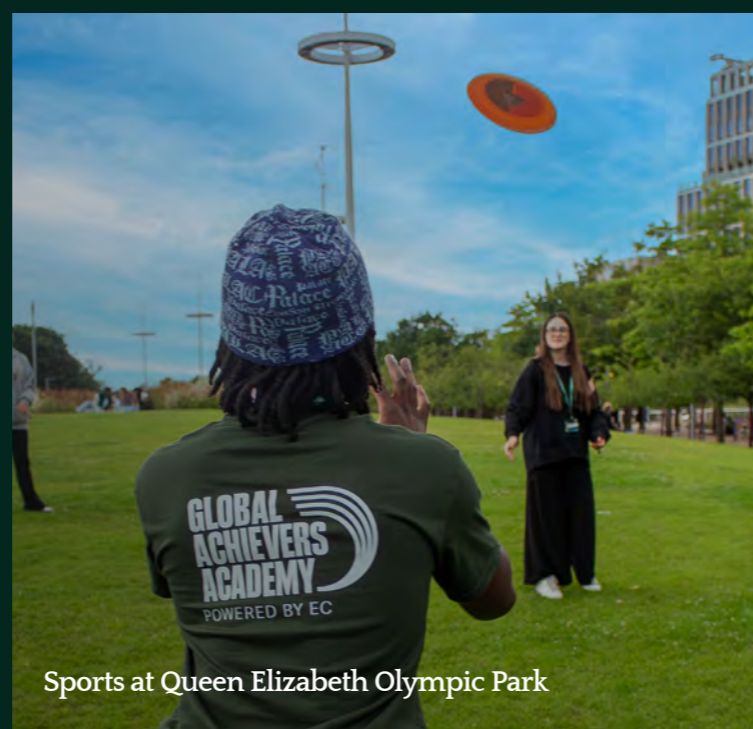
Sports at Queen Elizabeth Olympic Park