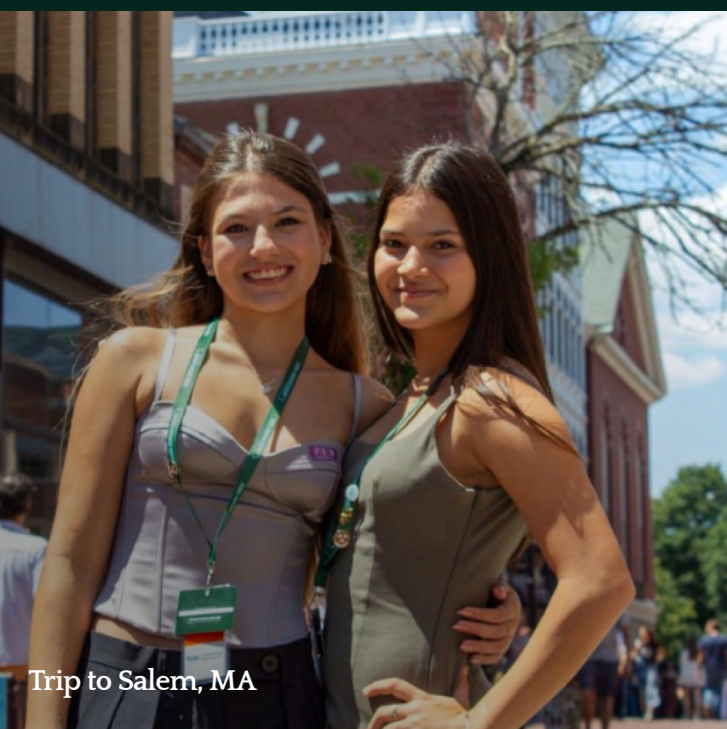
Trip to Salem, MA