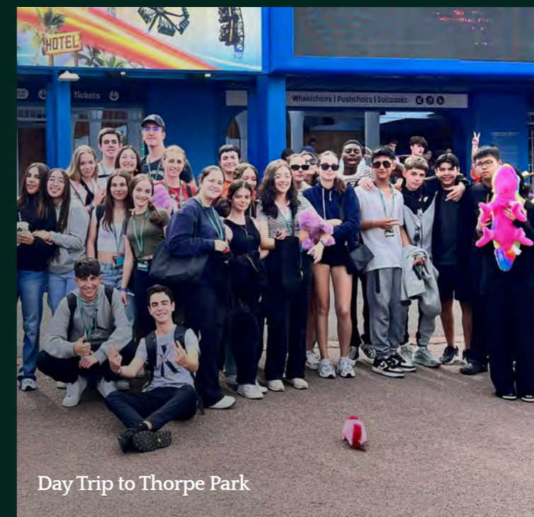
Day Trip to Thorpe Park