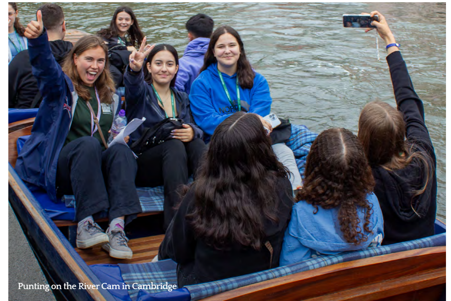
Punting on the River Cam in Cambridge

The campus is well connected to the many iconic sights of London and close to the City of London and the financial district.