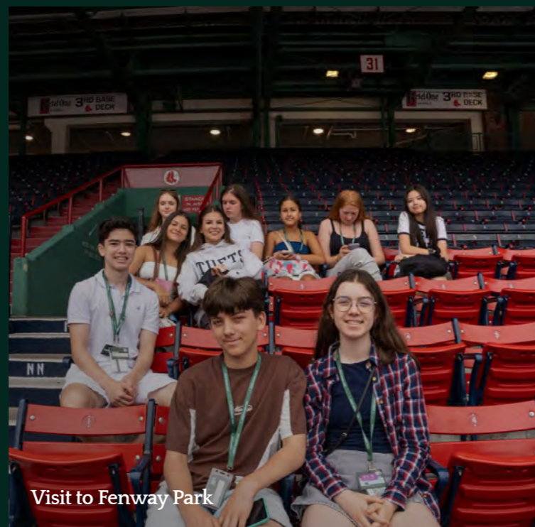
Visit to Fenway Park