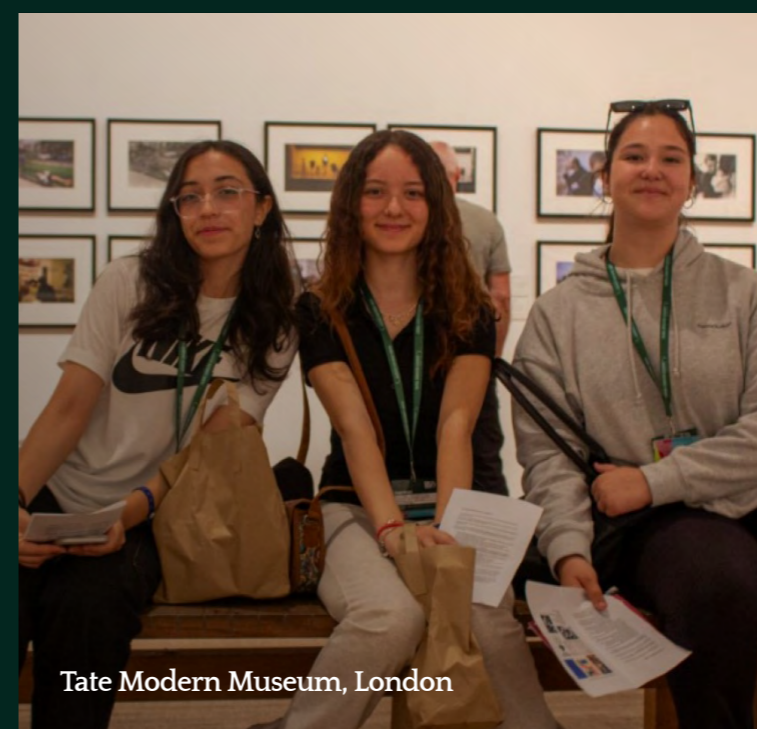
Tate Modern Museum, London