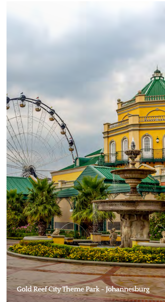
Gold Reef City Theme Park - Johannesburg

However it is the part of the planet identified by the United Nations as being the most vulnerable to climate change. We will be looking at some of the environment and sustainable issues facing Africa. Whilst the history of Africa is long and complex, it is the continent widely accepted as being the origin of the human species.