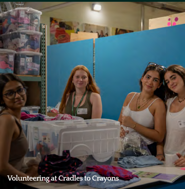
Volunteering at Cradles to Crayons