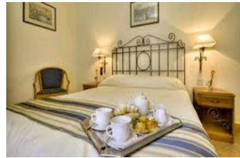
KENNEDY NOVA HOTEL