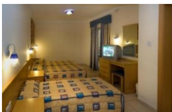
BAY VIEW HOTEL