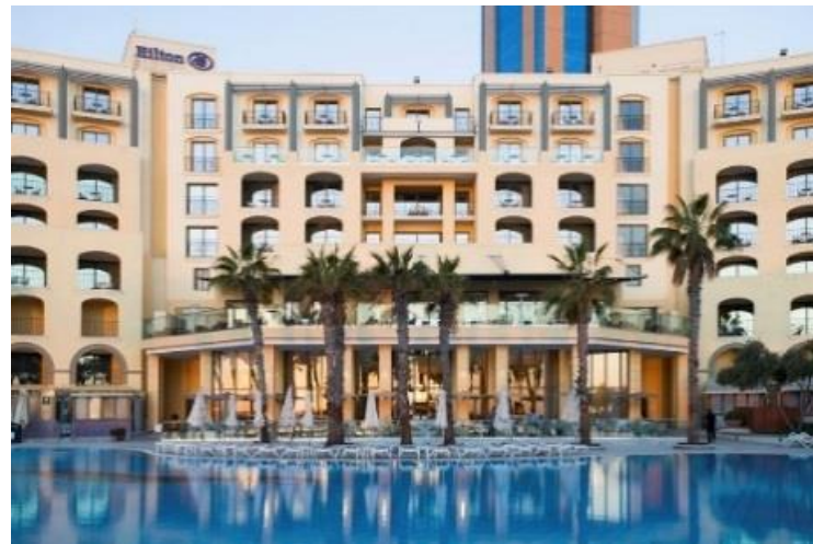
THE HILTON HOTEL

Students from 18 years old will be required to pay an Environmental Contribution amounting to €0.50c per night up to a maximum of €5 for each continuous stay in the Maltese Islands.