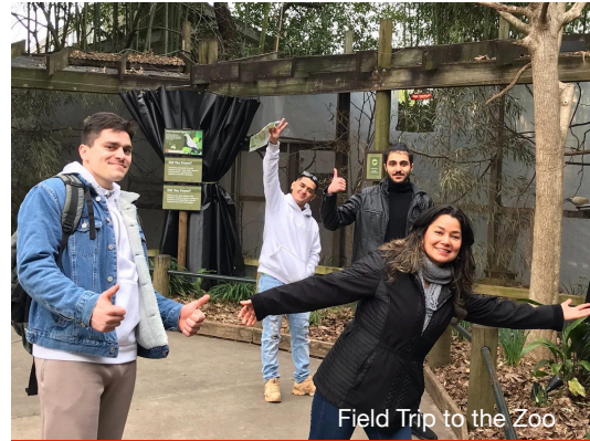
Field Trip to the Zoo

You will join the college or university at the beginning of the next semester.