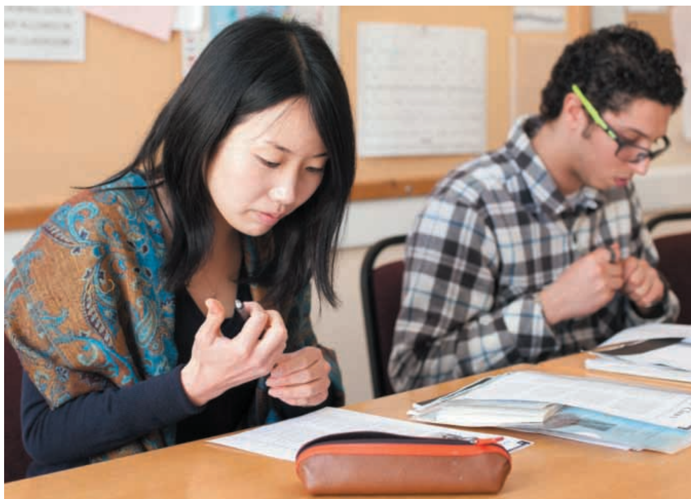
IELTS Exam Preparation (8-12 week courses)