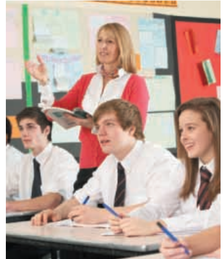
State School Placement With EAP Preparation

We will arrange accommodation and help with any issues that arise during the student's time here and try to match the student with a child in the family that attends the same school to ensure full integration. We can also arrange a guardian, if needed, for an extra cost.